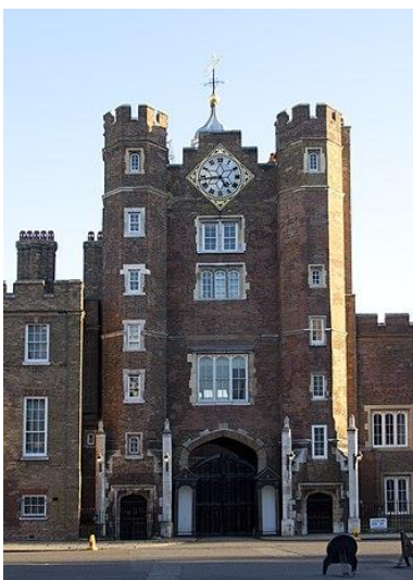
St James Palace

Moving on we came across St James's Palace, the most senior royal palace in London. It was built by Henry VIII on the site of an isolated leper hospital dedicated to Saint James the Less and used mainly as a hunting lodge. Whilst it is no longer the residence of the monarch, it is the ceremonial meeting place of the Accession Council- so where Charles III was proclaimed King in 2022 and also the London residence of several members of the royal family.